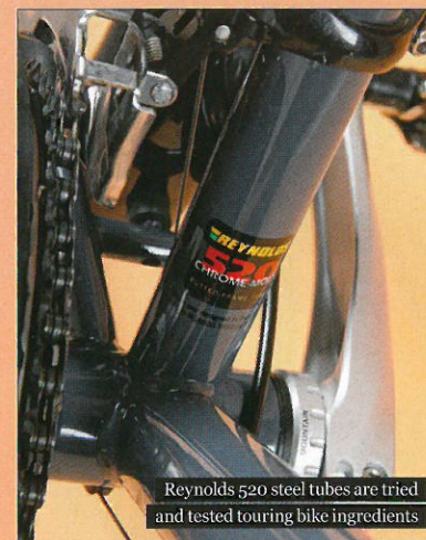
Reynolds 520 steel tubes are tried and tested touring bike ingredients

The Dawes Coast2Coast is an exciting tweak on some old ideas. The spec is superb, the frame is great, and it's just a little bit different from most run of the mill drop-bar bikes. You could even use it a lively little commuter when you're not crossing the Himalayas.