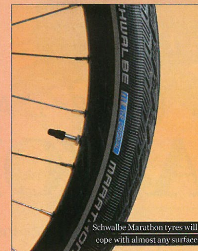
Schwalbe Marathon tyres will cope with almost any surface